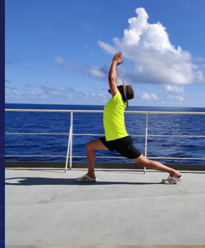
Extended Leave Ratios