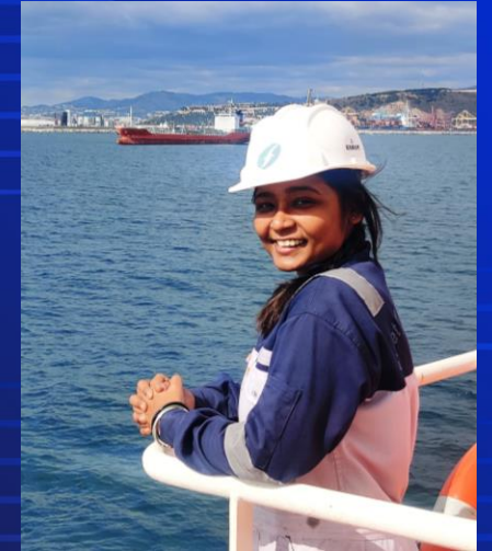
Demand for ' Next Gen ' skillsets